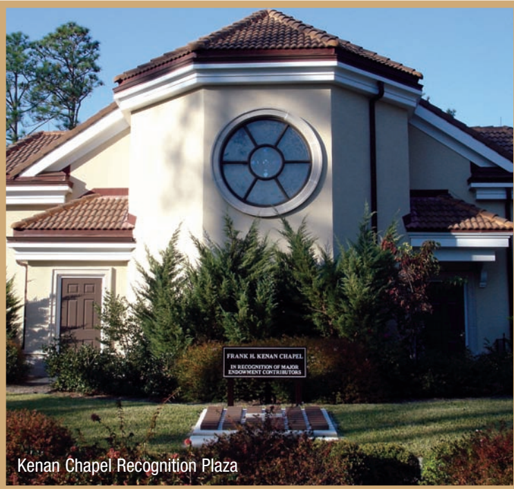
Kenan Chapel Recognition Plaza

PRSR.T.STD. US POSTAGE PAID WILMINGTON NC Permit #665