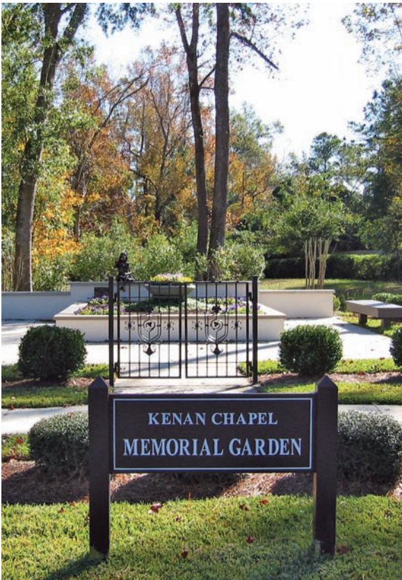
Entrance to the Memorial Garden