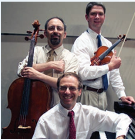
The Atlantean Trio